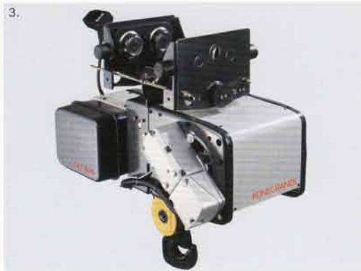
1. Low headroom trolley, 2. Double girder trolley, 3. Normal headroom trolley