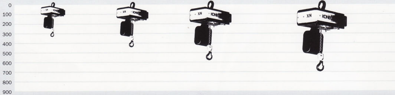
C-DIMENSION WITH DIFFERENT TROLLEY COMBINATIONS [mm]